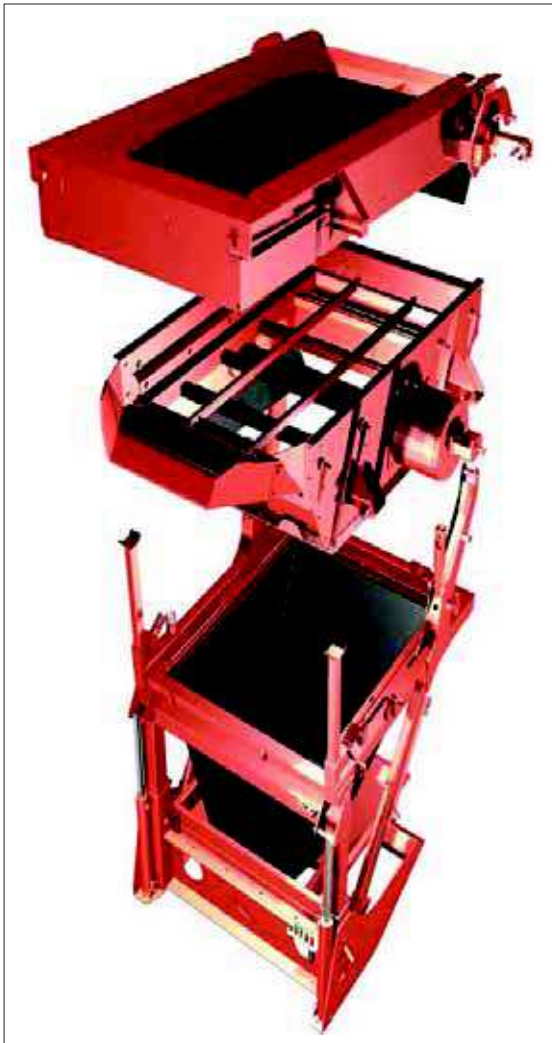
Pre-Screen Module (Optional)