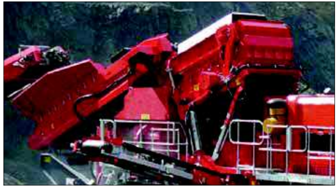
Hopper and Feeder

Unrestricted feed opening reduces blockages, bridging and maximizes output