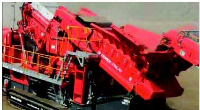
Hopper and Feeder