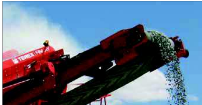
Conveyor - Middle Grade