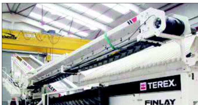
Hydraulic Folding Oversize Plus Conveyor