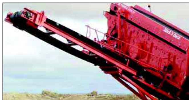
Conveyor - Oversize Minus