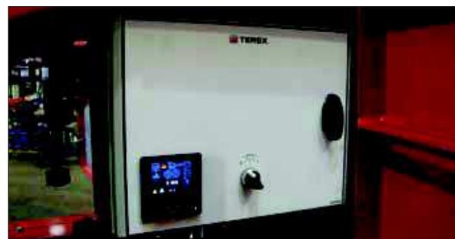
User Friendly Interface