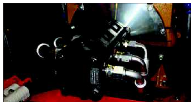
Pump 1: Triple 33cc/rev, 33cc/rev, 26cc/rev