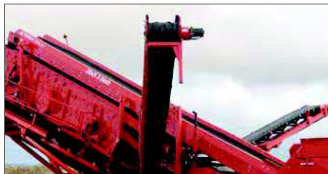
Conveyor - Oversize Plus