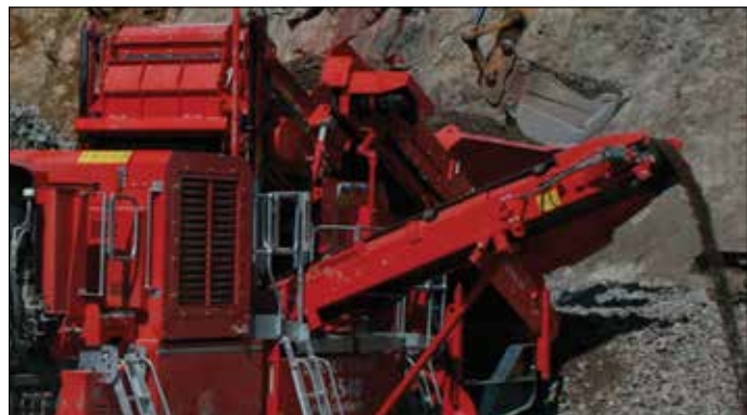
Pre-screen side Conveyor

Stockpile capacity: 69.4m 3 (90.8yd 3 ) @ 40°