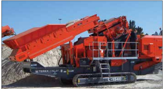
Hopper and Pre-screen