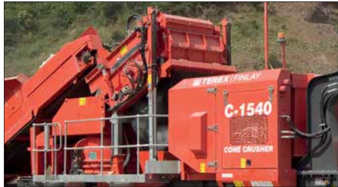
Pre-screen module in working mode