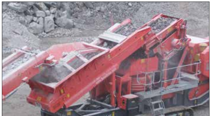
Hopper and Feeder