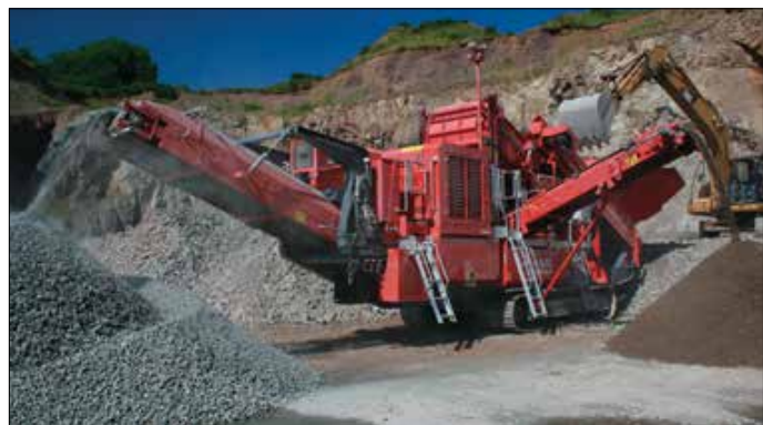
Pre-screen side Conveyor