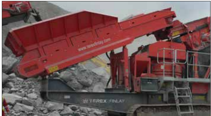
Hopper and Feeder

Hydraulic overload protection with automatic reset. This allows the upper frame to lift up, to permit the passage of tramp iron and other un-crushable material. The system then automatically returns the upper frame to its original position