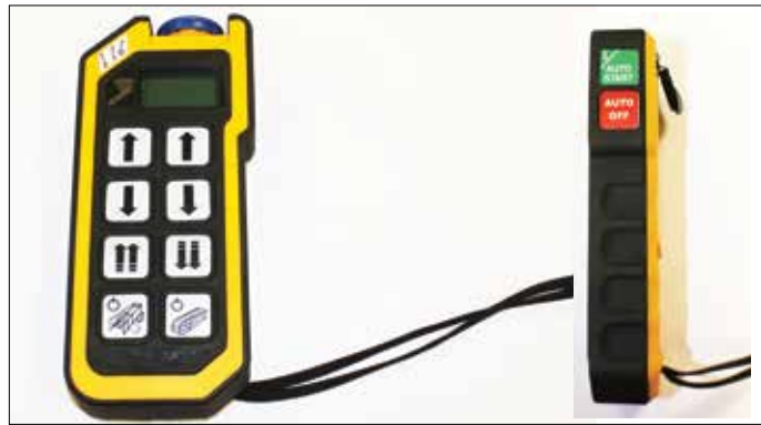
Remote Control Unit (Optional)