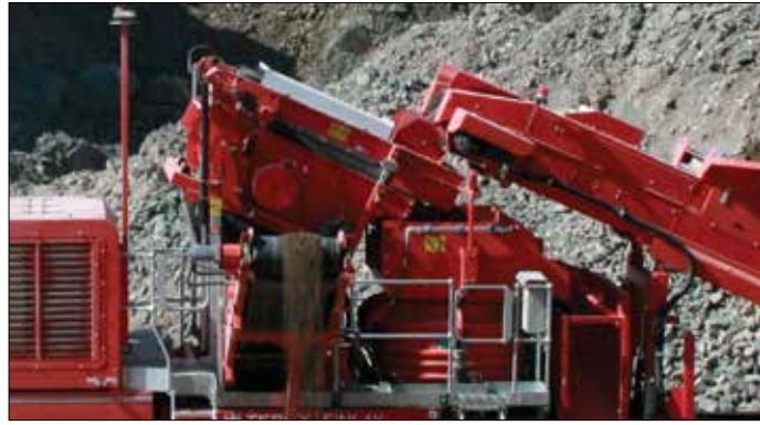
Pre-screen module in working mode